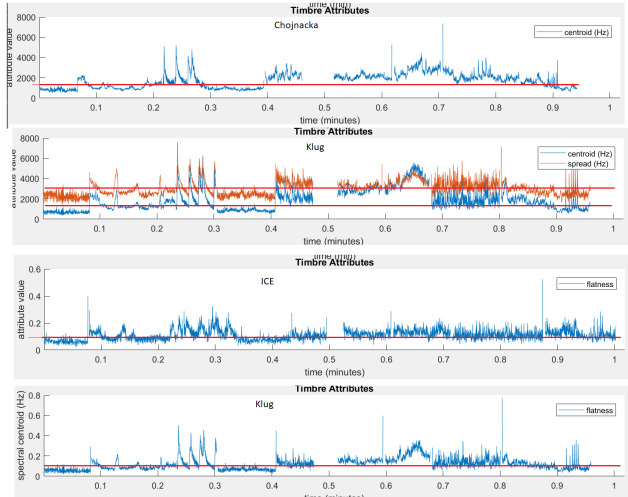
Figure 2: positive results, plotted with labels

but also high harpsichord clusters. The harpsichord likely pushes the spectral measures above the threshold; because the harpsichord is there an element of dissonance in an otherwise consonant sound, this deviation from the threshold is musically meaningful.